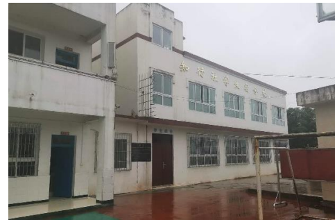
Construction of Student Dormitory in Guizhou