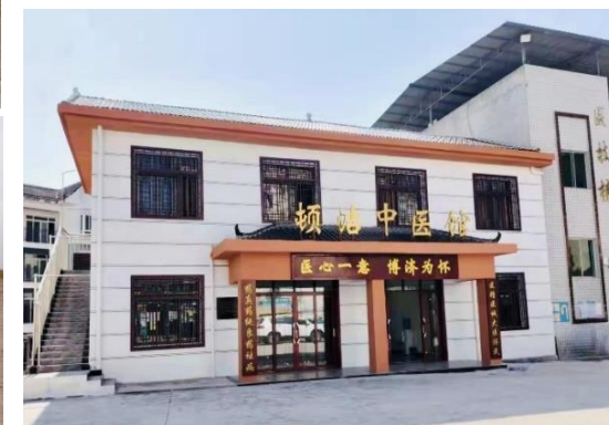
Construction of Chinese medical clinic