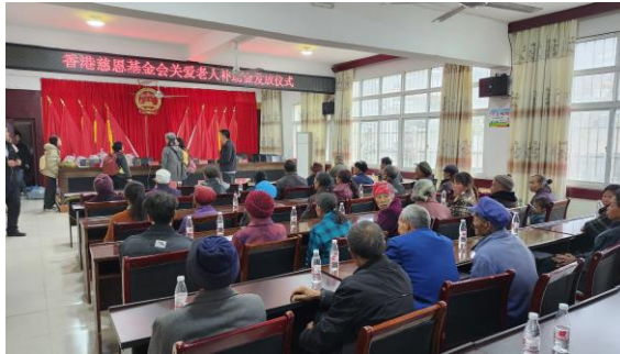
Delivering aids to elderly in Guizhou