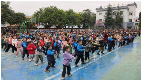
Volunteers visiting schools in Guizhou