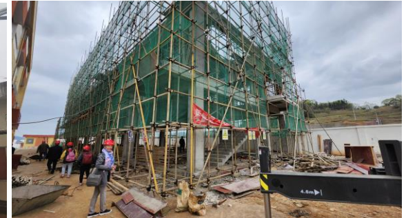
Volunteers inspecting the building progress in Guizhou