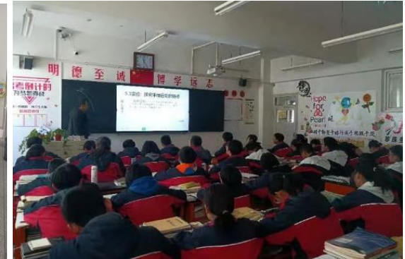
Donation of electronic blackboards