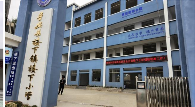
Completion of Complex Building in Guizhou