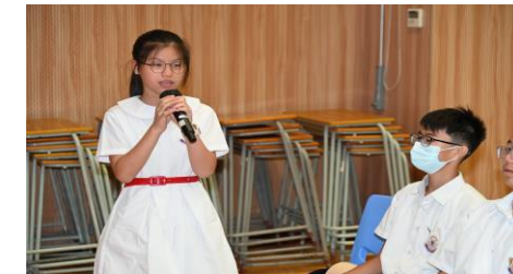
The 2 nd year Grace Charity Academic Achievement Award Ceremony