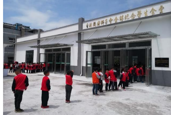
Building of students' canteen