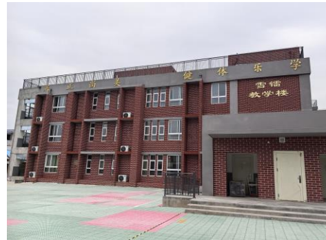
Construction of Teaching Building in Henan