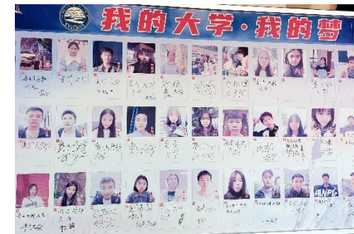
The dream of high school student