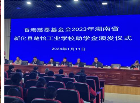
Distribute aid to the students in Guizhou and Hunan