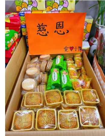
Visiting elderly homes

In early 2024, our committee/group has set up a “Grace Caring Team”. The main task of this team is to pay regular visits to three elderly homes monthly and arrange caring activities which include offering the elderlies afternoon snacks and drinks on the day of visit, playing games with them and offering them some of their daily essential items. All these resources are donated by kind-hearted people.