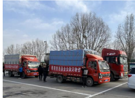
Materials donated for Gansu Earthquake in Dec 2023