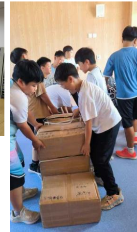
Students help to unpack the books