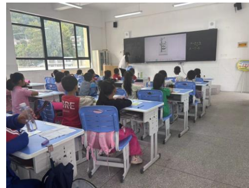
Donation of desks and chairs