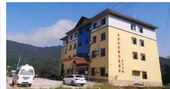
Construction of Medical station