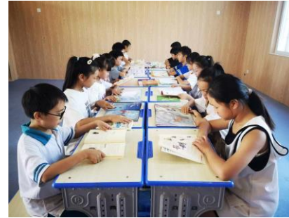
Donations of school library in Guizhou