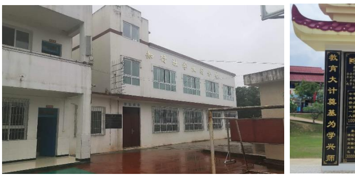
Completion of a Teaching Building in Thailand

Construction of Student Dormitory in Guizhou