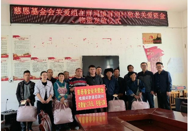
Delivering blankets to elderly