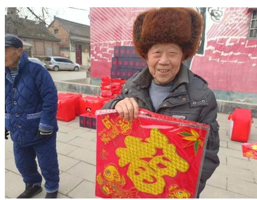
Delivering care packages to the elderly in Chinese New Year